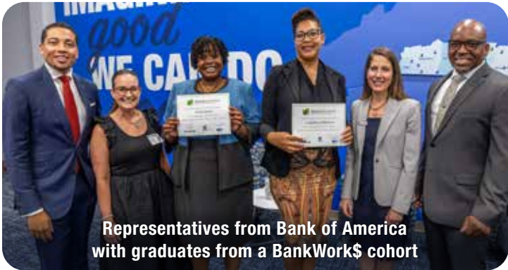
Representatives from Bank of America with graduates from a BankWork$ cohort